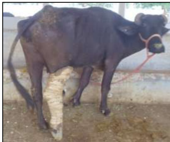
Figure 4: Status of the animal after 40 days of treatment with partial weight bearing

Compound fracture is one type of fracture wherein there is communication between the fracture site and outer skin wound. Due to limited amount of soft tissues covering over the metatarsal and metacarpal bones, these fractures are frequently converted into compound fractures resulting from the penetration of the bone within (Ayaz, 2000). Due to the lack of satisfactory immobilizing devices with open dressing facilities, the compound fractures usually do not respond to the treatment and develop such complications that amputation will only save the animal (Nayak and Samantara, 2010). Since, compound fracture needs daily dressing of the wound, external skeletal fixation is the right choice. Economic considerations and non-availability of orthopaedic implants for large animal at field level makes the compound fractures non-treatable. Dealing with the compound fracture will always remain a challenge to the clinician (Mulon, 2011). More over radiological assessment is almost impracticable at field level with no x-ray infrastructure facility.