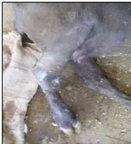
Figure 2: Fractured hind limb (white arrow) indicates wound at the medial side of fractured area