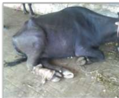
Figure 1: Buffalo lying down with fractured hind limb before treatment

A six year old female buffalo weighing 450 kilograms was reported to Teaching Veterinary Clinical complex, Veterinary College and Research Institute, Orathanadu with the complaint of broken hind limb happened while jumping across feed manger. The animal was already treated by a local vet using Plaster of Paris for a week. Clinical examination of the animal revealed that it was a compound fracture of right metatarsal bone (Figure 1). The open wound was located on the medial aspect of metatarsal bone (Figure 2). Fractured bone fragment was visible through the wound site. Pus discharge was noticed at the fractured site.