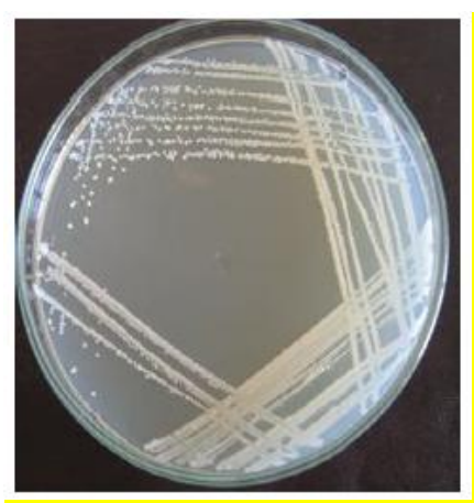
Figure 1: Colony morphology of schizosaccharomyces sp. in PDA medium

The macroscopic and microscopic properties of colonies are shown in figures 1 and 2. Schizosaccharomyces sp. have soft, flat and white to beige color colonies on PDA medium.