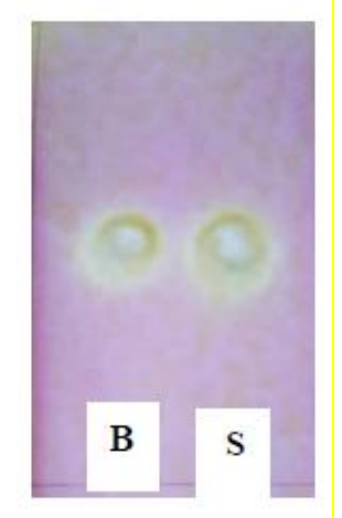
Figure 3: Assay of produced sorbitol by TLC (B: control and S: produced sorbitol)

Schizosaccharomyces sp. was able to produce sorbitol from sucrose after 24hrs. The maximum yield of sorbitol was obtained on the fourth day. Produced sorbitol was assayed with TLC (figure 3). Also, produced sorbitol by the desired yeast was identified and confirmed using kit. The levels of remaining sucrose and biomass during the process is illustrated in figure 4.