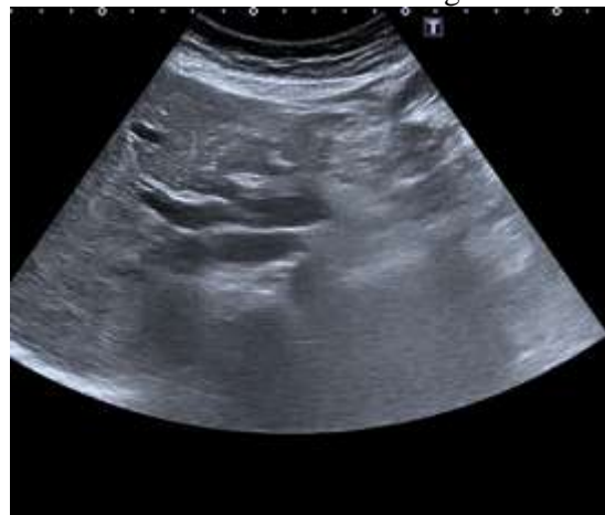
Figure1 : Longitudinal USG shows non visualization of GB with normal CBD

41 Years old non obese healthy female from the south Indian origin who was previously diagnosed as chronic calculus cholecystitis 4 months before, came with the similar complaint of right upper quadrant pain. Although patient was in fasting, By USG gall bladder was not localized even by repeated examination and different radiologist.