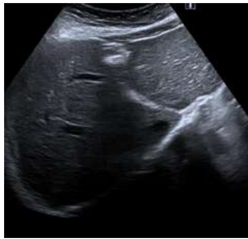
Figure 2 : Transverse USG shows non visualization of GB in GB fossa