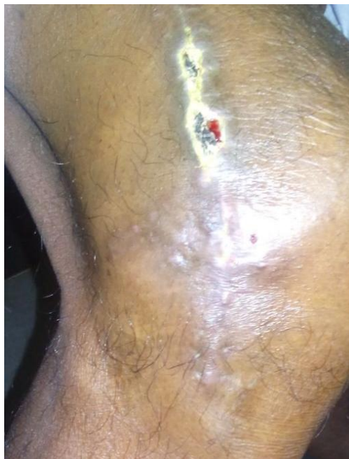
Figure 3: Post-operative photograph showing healed lesion and no signs of recurrence

Surgical treatment is often indicated for curettage of bone, resection of necrotic tissue, excision of sinus tracts, and drainage of soft tissue abscesses (Robinson et al. , 2005). Although recommendations for incision and drainage of abscesses, sinus tract excision and more extensive debulking of infected tissue are made, it is unclear how often these procedures are necessary (Tekin et al. , 2012; Smego and Foglia, 1998; Kargi et al. , 2003).