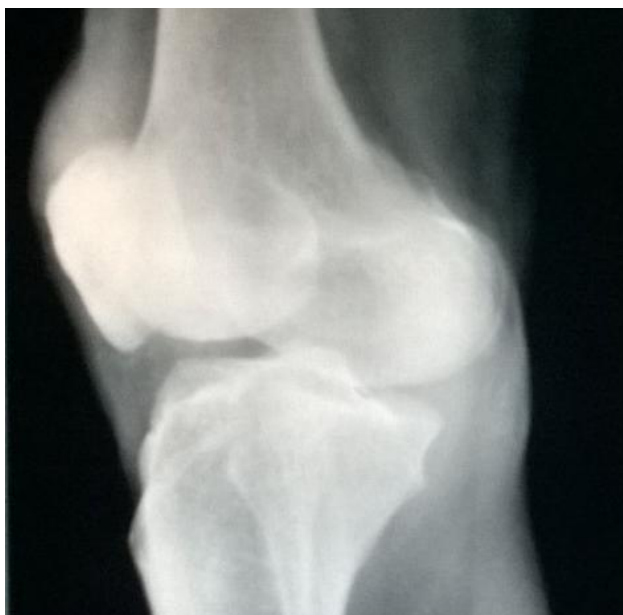
Figure 1: X ray of the knee joint showing nonspecific changes with mild reduction in joint space

In the majority of cases of actinomycosis the therapy consisted of surgical debridement combined with prolonged antibiotic therapy (Tekin et al. , 2012). This chronic infection elicits marked fibrotic reaction making difficult for drug penetration and unable to achieve the desired serum levels of the antibiotics delaying response to treatment (Ramachandra et al. , 2014; Hay and Adriaans, 1998). Penicillin is the drug of choice for treatment of actinomycosis (Ramachandra et al. , 2014) and it must be considered in a moderately high dosage parenterally over a long period of time. Routinely 1-6 million units per day administered for a minimum period of 6-8 weeks. Severe cases may require 12 to 20 million units per day for a more sustained period of time (Dom and Pittevis, 1999).