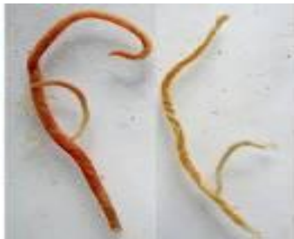
Figure 2: Adult worms of Syngamus trachea isolated from native chickens trachea