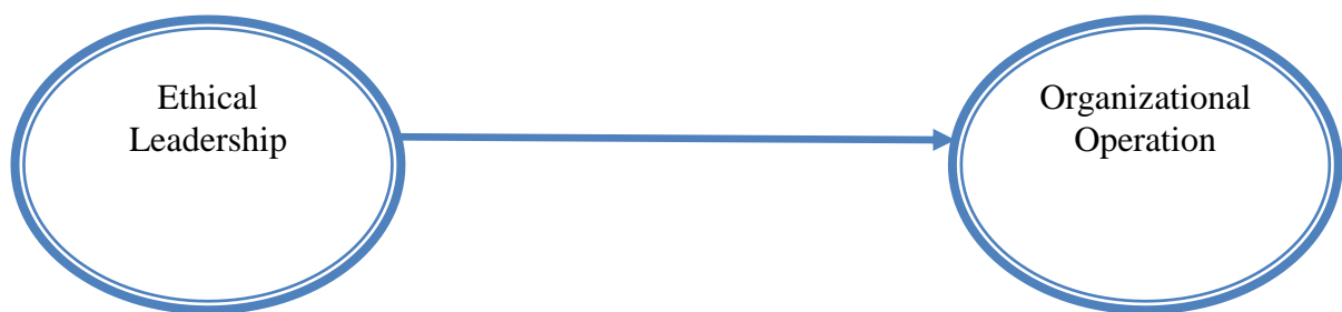
Figure 1: The Conceptual Model of the Research Adopted from Suhan, et al. , (2006) and Hoogh and Hartog (2008)

Considering the above, the research hypothesis was formulated as follows: