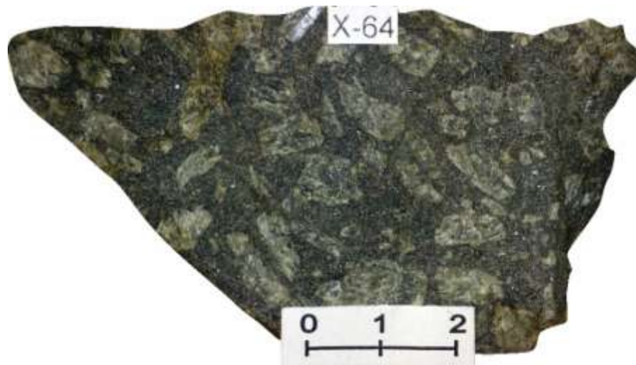
Figure 1.4: Megaplagiophyric trachybasalt in the Akchasai River basin

Chatkalo-Kuramin region with dikes and dike formations" in the period from 2010-2015 in the Goskomgeology. To collect materials, 20 outlets were set up in the field for sampling, exploring the area, and carrying out macro and micro petrographic sections. The routes passed through swarms of dykes in the North. Nuratau, Almalyk and other nearby areas. Also, when writing this article, reports were used that were compiled in the USSR (1960, 1975) for a complete understanding of the structure of the district. Materials on complex dikes were taken from the materials from Buzanskaya (1955). Silicate analyzes of 50 samples were carried out at the Central Laboratory of Goskomgeology (Republic of Uzbekistan).