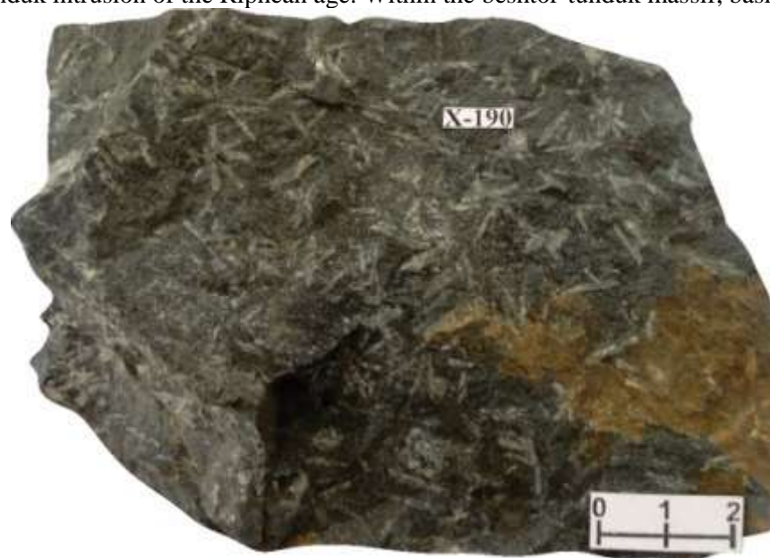
Figure 2: Megaplagiophyric trachybasalt

In the area under consideration, megaplagiophyric trachybasalts are exposed in the upper reaches of the river. Chiralmasay, on its starboard side in the Pskem ridges. These dikes occur among the granitoids of the Beshtor-Tunduk intrusion of the Riphean age. Within the beshtor-tunduk massif, basic dikes are very