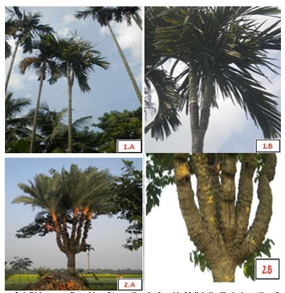
Figure 2: 1. Dichotomous Branching of Areca Catechu found in Mollabelia, Haringhata (Case-I) 2. Branching crown with six heads of Phoenix sylvestris found in Baliadanga, Haringhata (Case-II)

Six branches are developed from the single stem of P.sylvestris in case-II. Here, the plant is about 22 years old and the branches are derived from about 10ft. above from the soil. The branches are come out from two lateral directions and vary from 8-10ft. in length. It is known from the local people that total number of branches was seven; one of them became dried and detached from the head. All the branches bear normal leaves, flowers and fruits and give sugar juice in winter season. In the early stage of the plant, due to disruption of apical part by grassing animals branches may be originated (Figure 2: 2A & 2B).