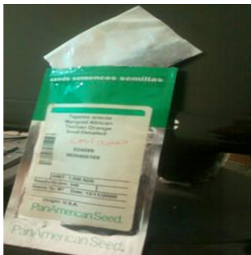
Figure 1: Seeds used in the experiment