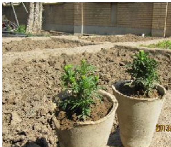
Figure 2: Parsley pot