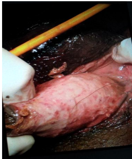
Figure 3: Excision of penile skin

After the case was referred to urologist, excision of gangrenous tissues was done under general anesthesia in two sittings. Necrotic tissues were sent for biopsy. Intra and post-operative periods were uneventful. Patient recovered and received treatment to control diabetes. HPE of excised tissue shows necrosis, fibrinoid thrombosis of nutrient vessels, polymorphonuclear cell infiltration with microorganisms identified in the involved tissues which are in favor of Fournier's gangrene (Figure-4).