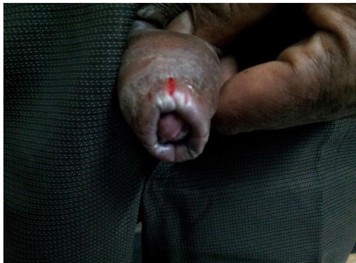
Figure 1: Penis with swollen prepuce with vertical fissures all around the prepucial orifice

Next day he presented with swelling of shaft of the penis with dusky, red colored blisters, some oozing with foul smelling discharge and on palpation bullae was flaccid, crepitus was present. Patient was looking toxic. He was not able to pass urine so foley's catheter was introduced (figure-2), and pain reduced so also tenderness. No lymphadenopathy was observed. On examination tachycardia of 110 per minute, BP 100/60 mm Hg, Respiratory rate was 26/min, Temperature was 102°F. Heart & Lungs, no abnormality was noted, Abdomen was soft, no organomegaly.