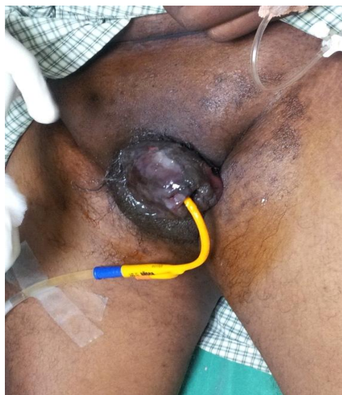
Figure 2: Shaft of the penis dusky, red colored blisters with Foley's catheter

Next day he presented with swelling of shaft of the penis with dusky, red colored blisters, some oozing with foul smelling discharge and on palpation bullae was flaccid, crepitus was present. Patient was looking toxic. He was not able to pass urine so foley's catheter was introduced (figure-2), and pain reduced so also tenderness. No lymphadenopathy was observed. On examination tachycardia of 110 per minute, BP 100/60 mm Hg, Respiratory rate was 26/min, Temperature was 102°F. Heart & Lungs, no abnormality was noted, Abdomen was soft, no organomegaly.