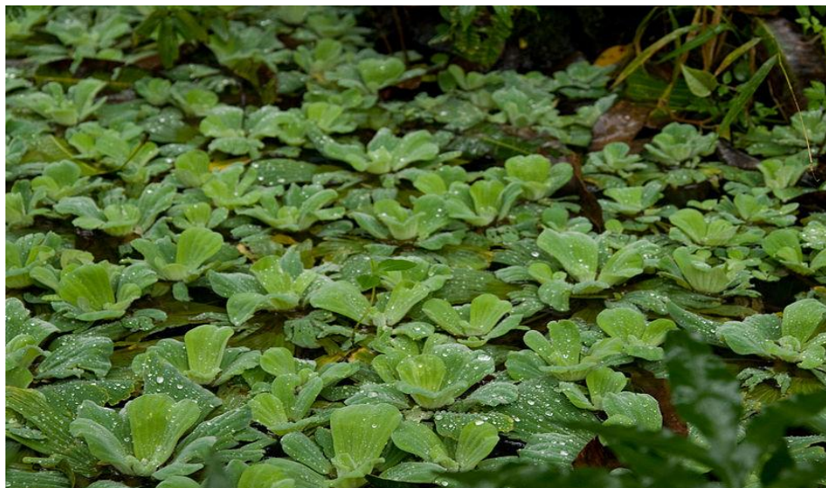
Figure 1: Pictorial View of Pistia stratiotes L.