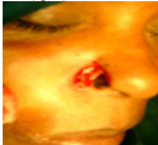
Figure 2 : Image of the defect