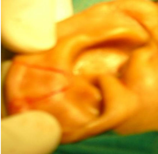
Figure 3 : Image of donor site

On examination, the site of the defect had minimal scarring and no signs of inflammation. Looking at the site and size of the defect, a plan was made to reconstruct the defect in a single stage operation, using a composite graft taken from the ear, from the root of the helix (Figure 3). The composite graft was harvested from the root of the right helix after marking the defect and the donor site was closed primarily (Figure 4).