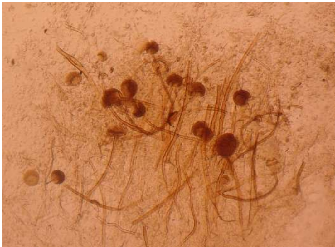
Figure 2: Fungal hyphae and sporangia in KOH mount from specimen