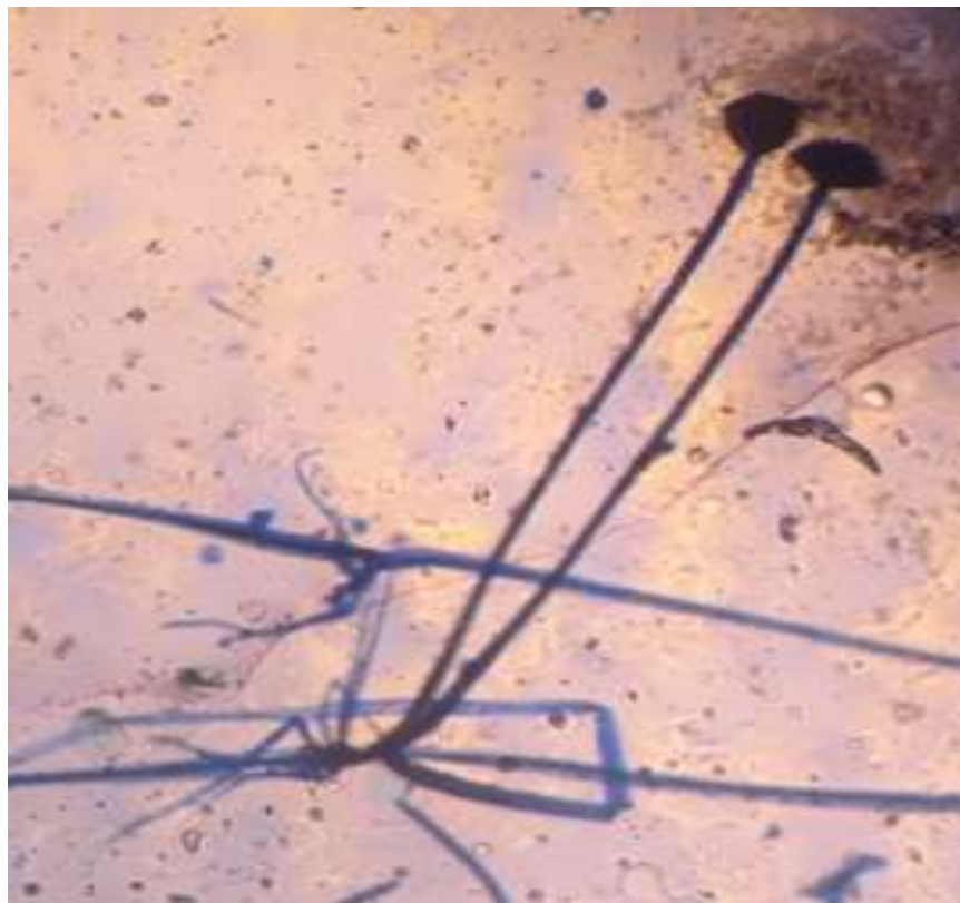
Figure 3: Lactophenol cotton blue mount showing rhizoids and sporangia