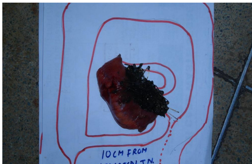
Figure 1.4: Shows FB's with the excised terminal ileum