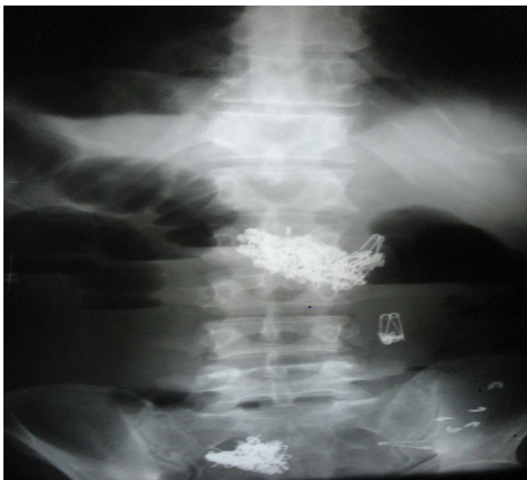
Figure 1.2: Shows x ray abdomen erect with multiple FB in the GIT