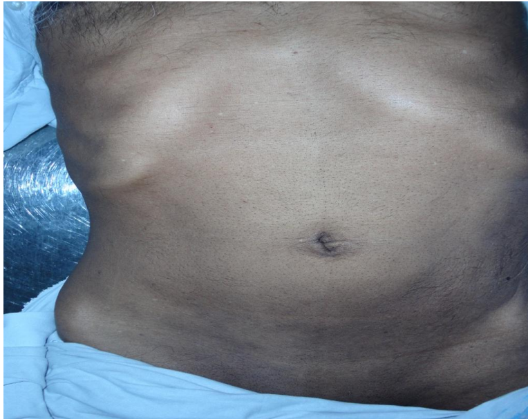
Figure 1.1: Shows preoperative image of the abdomen

naso gastric tube & Foley’s catheter in situ we took him for an emergency surgery. Under GA/ET, aseptic precautions in a supine position through midline incision abdomen opened in layers. The following are noted as the intra op findings. A) Multiple FB’s in the gastric and distal ileum & sealed perforation of distal ileum (Figure 1.3 and 1.4). Hence we performed removal of FB’s by gastrotomy, multiple enterotomies, 4cm of distal ileum resection and anastomosis (side –side). After perfect hemostasis DT kept and wound closed in layers. Dressing done. The postoperative periods were uneventful and discharged from the ward. Before discharge to prevent future complications psychiatric counselling was given.