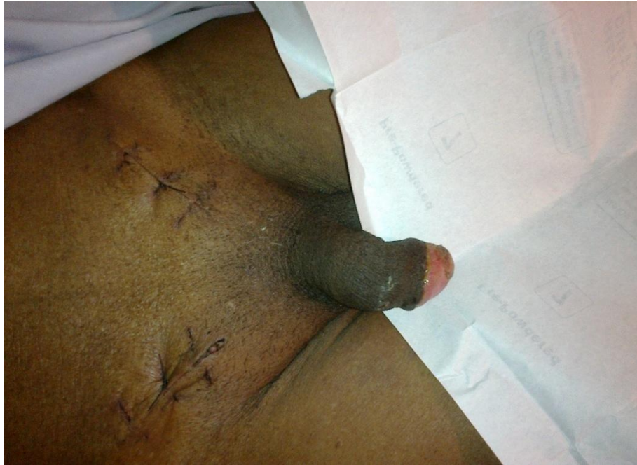
Figure 1.1: Post op image of the wound

enhanced CT to rule out any inguinal lymphode metastasis but nothing was found. At present patient doing fine and on regular follow up (Figure 1.2).