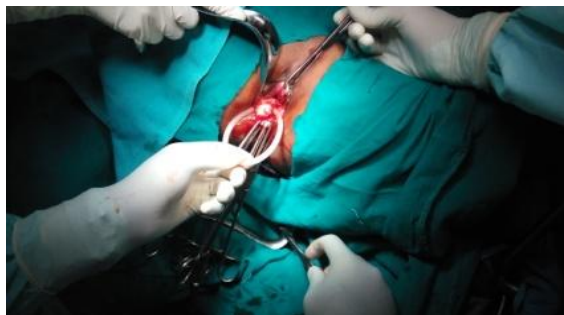
Figure 1: Examination under anaesthesia