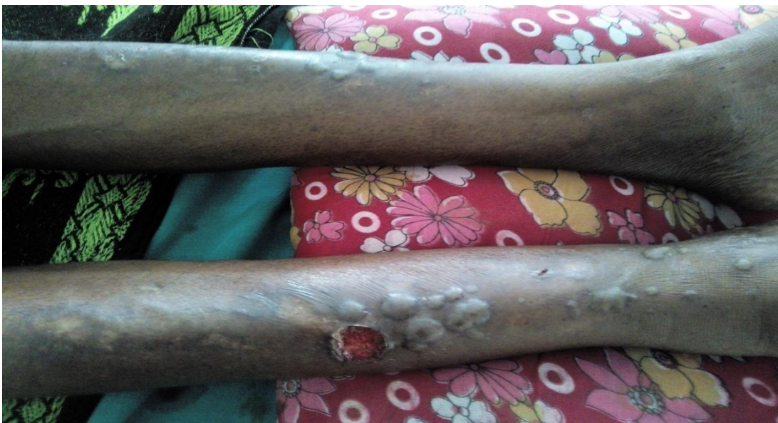
A) Multiple, discrete, tense hemorrhagic bullae of size ranging from 0.5 to 2.5 cm in diameter over the shin of both legs