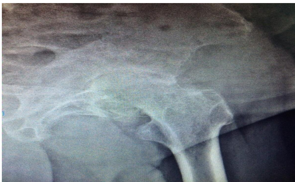
X-ray 1: Pre-OP

In this study, patient's functional outcome was assessed by HHS. This score has three parts. First part is as follows: questions related to pain, distance travelled while walking, limping, wearing socks and shoes, climbing stairs, sitting and using public transportation. In the second part differences in limb length and joint movements are assessed. In the third part flexion, abduction, adduction and external rotation of the hip joint are examined. The final score is the sum of the score allocated for each part. In this study HHS survey after surgery compared with before surgery showed considerable progress in joint function, so that HHS of 36 was elevated to 84 after one year.