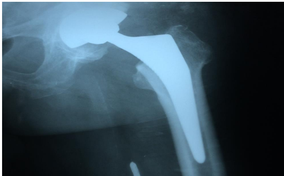
X-ray 3: Follow-up at 12 months

Kim et al. 's study in three year follow up of patients with bilateral hip ankylosis who underwent joint replacement surgery reported that HHS mean of 55.4 reached 82.3 which were similar to this study. Also in the survey conducted by He et al. , the HHS of 15-21 before surgery increased to 86.25 just like our study. In our study we used posterior approach as the surgical modality.