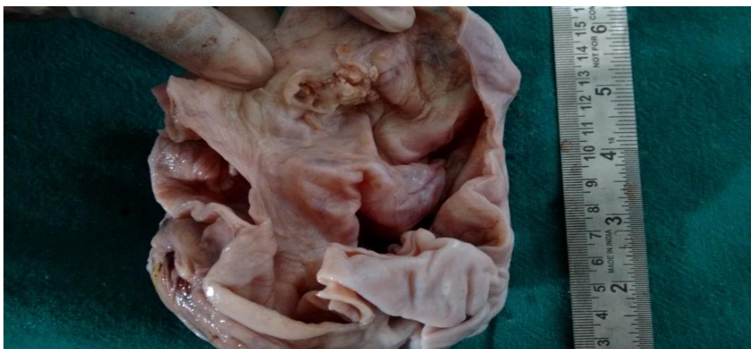
Figure 1: Gross specimen showing a solid mural nodule in the wall of ovarian cyst

A 55 year old post menopausal lady presented with the chief complaints of lump and pain in abdomen since 8 months. The patient was known hypertensive and diabetic and took ATT 12 years back. Her medical history was otherwise unremarkable.