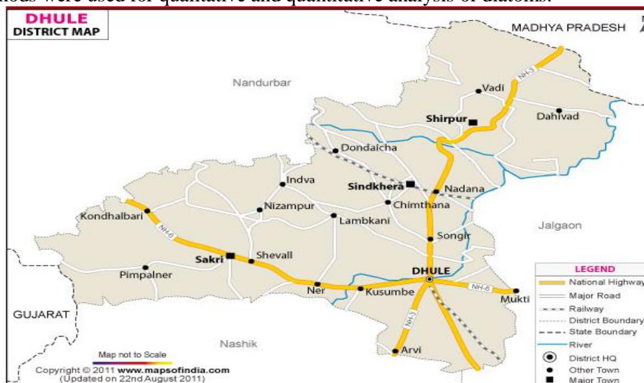
Map Location

The study site was visited at an interval of a month from January, 2009 to December, 2010. Surface water samples were collected from three stations of Budki M.I.tank (BMIT) namely BMIT-A, BMIT-B and BMIT-C between 8 a.m. to 10 a.m. For each parameter studied the average of these stations were taken. Standard methods were used for qualitative and quantitative analysis of diatoms.