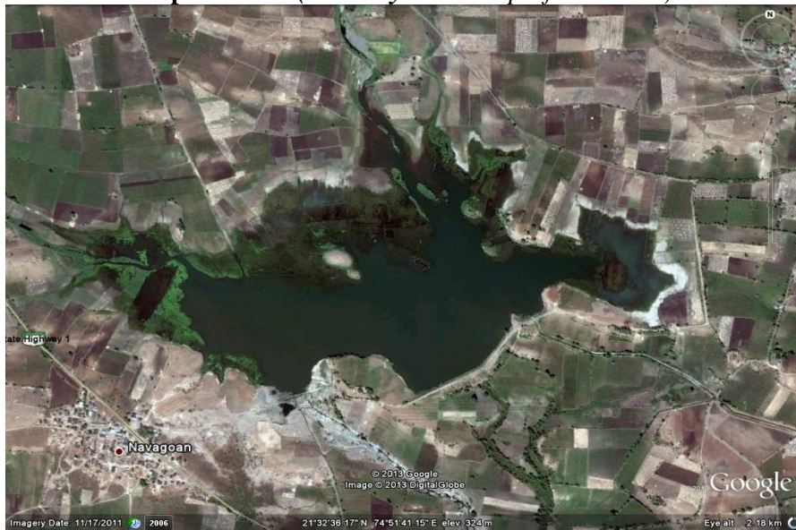
Google Satellite image of Budki Medium Irrigation Tank (21°32'36N 74°51'41E)