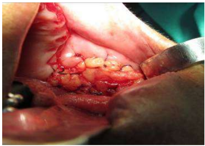
Figure 3: Primary closure with buccal fat pad