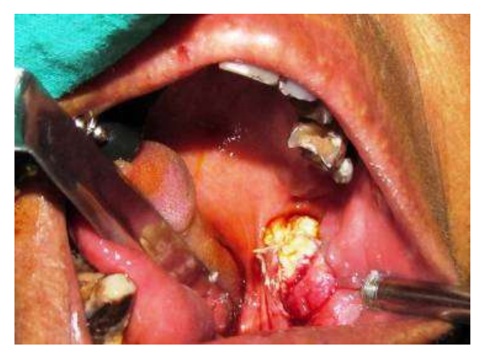
Figure 1: White cauliflower like growth on left buccal mucosa

A 65 year old female patient presented to the department of oral and maxillofacial surgery at our centre with a chief complaint of proliferative painless growth on left buccal mucosa for a period of one year. Intraoral examination revealed a thick, white cauliflower like growth on left buccal mucosa (figure 1) approximately 5cm × 5cm of size its greatest dimensions. The growth was non tender, non friable and well defined with raised margins, with no history of trauma, trismus, oral bleeding, dysphagia or pain. Regional lymph nodes were non palpable and non tender. Patient gives a history of tobacco chewing since approximately 40 years. Incisional biopsy was performed which yielded a diagnosis of oral Verrucous carcinoma following which surgical excision of the lesion was planned. General anesthesia with nasoendotracheal intubation was achieved and wide excision with safe oncological margins of the lesion was performed. Surgical defect was reconstructed with pedicled buccal fat pad which was harvested (figure 2) and sutured to the surrounding mucosa (figure 3) with excellent post operative healing. The post-operative histopathological examination of the specimen revealed typical features of verrucous carcinoma depicting swollen and voluminous rete pigs extending into deeper tissues lacking cytological atypia. One year follow-up of the patient showed excellent healing and no signs of recurrence.