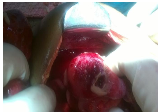
Figure 4: Jejunal fistula resected from urinary bladder