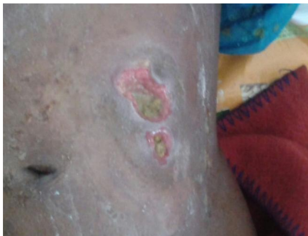
Figure 1: Enterocutaneous fistula

Histopathologically, the fistulous tract showed transmural dense chronic inflammatory cellular infiltration and histiocytic proliferation with Langhans-type giant cell reaction. Histological examination of the resected specimens revealed granulomas consisting of epithelioid cells, Langhan's giant cells, lymphocytes, mononuclear cells and central area of caseous necrosis in the ileocecal portion and mesenteric lymph nodes, which is typical of tuberculous involvement. TB of the lungs or of any other organ was not demonstrated. The patient's postoperative course was uneventful and five- drug antitubercular therapy was continued for a further 11 months. Follow-up was uneventful.