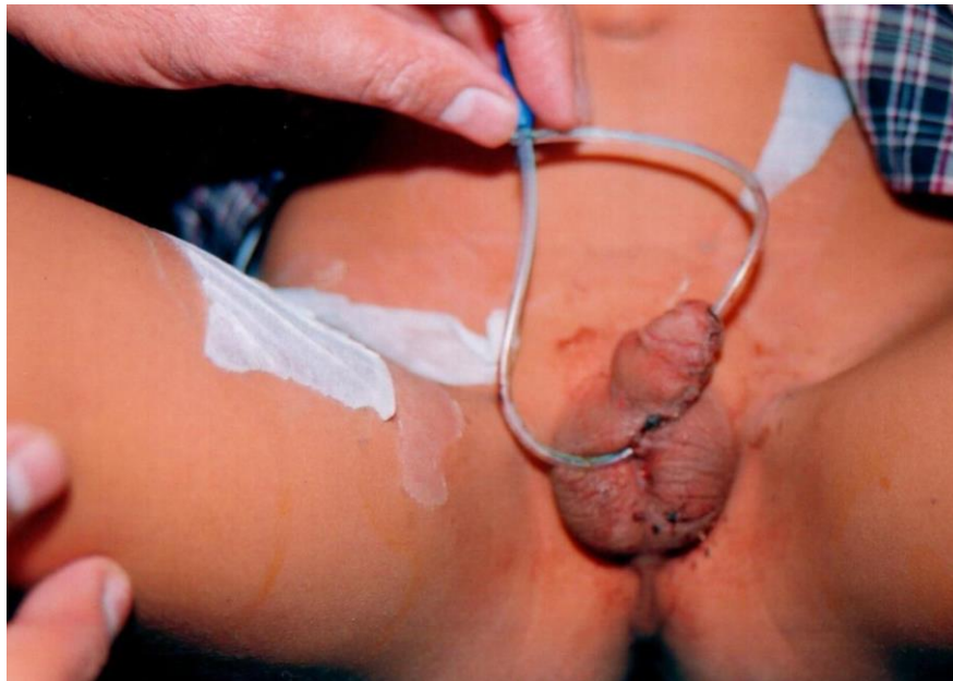
Figure 2: The Clinical Photograph with a Stent in Place