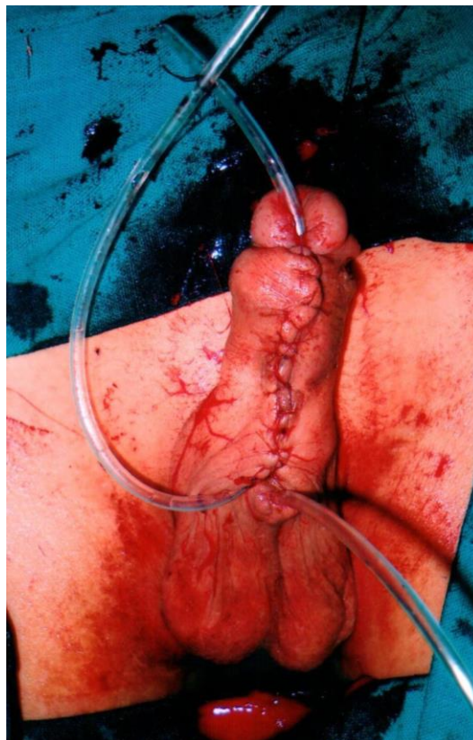
Figure 1: The Clinical Photograph Showing the Created Neourethra with a Proximal Opening and Catheter as well as Stent in Place

To summarize, the authors are of the opinion that in the management of hypospadias it is difficult to follow the tailor made approach in select group of patients and one have to find an out of box solution to make a satisfactory outcome. The present approach for management of this condition is just like when one need to overcome a disaster, one need a safest way and the creation of fistula is like a safety valve for prevention of poor outcome in a difficult repair.