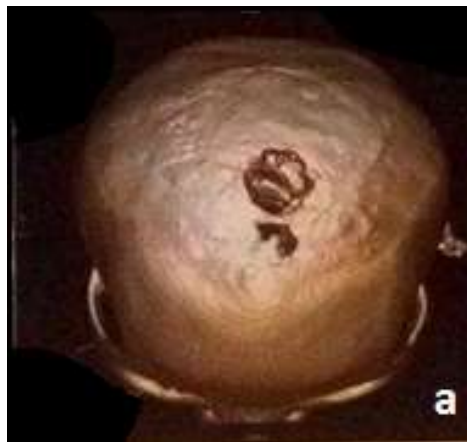
Figure 2: Brain CT scan: a: bone reconstruction showing lacunar images of the vertex