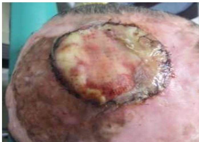
Figure 4: Post operative images after tumor reduction and skin graft