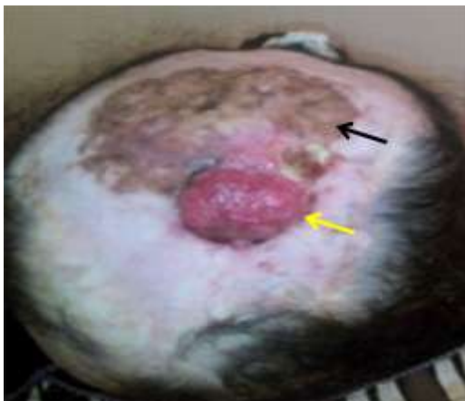
Figure 1: Pre operative image showing an oval lesion (yellow arrow) on the border of a grafted surface (black arrow) surrounded by an alopecia