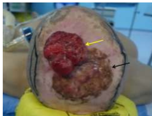
Figure 3: Pre operative image showing the tumor one month after the biopsy