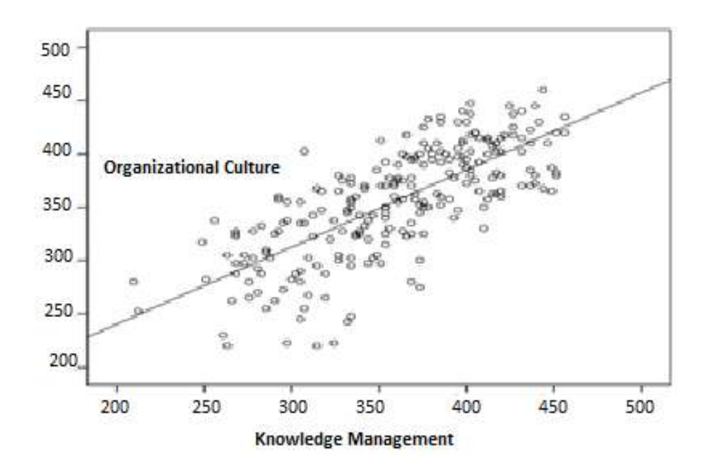
Figure 3: Pearson correlation test for knowledge management and organizational culture