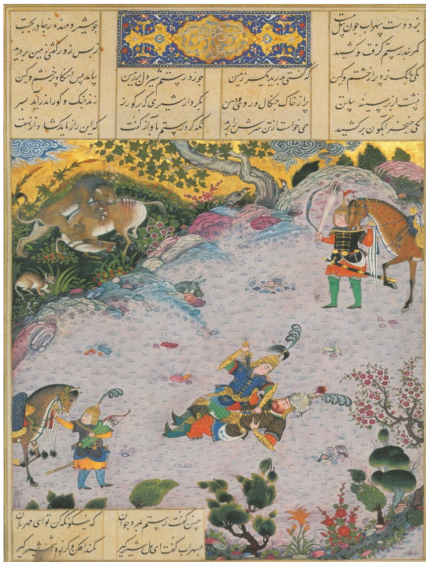
Figure 1: Suhrab hits Rutam on the ground (Painting Masterpieces of Iran, 2005)

with this content in other illustrated manuscripts of Shahnameh so that in addition to investigation and characterization of available values in hidden layers of the painting the relation between text and painting to be emphasized and painter’s benefit of the story and playing role of elements in this relation to be introduced. It should be noted that many cases in “investigation of the work” gained only through exploration and critical focus on the work and without using other resources and acceptability and usefulness of the work to the audiences were the goal and purpose.