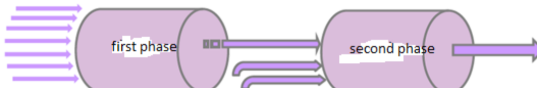
Figure 3: Phases of research

According to the research and examinations collected information and used model in this work is base on the type of output and by determining the inputs and outputs for every phase done by GAMS software. The decision maker unit in examined DEA unit or company named DMU. Generally DMU is a company or existence that change input to output and the assessing of operation is considered. In figure 3 output, input and the phases are shown to reflect a clear image into the mind of reader.