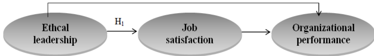
Figure 1: Conceptual model of research (researcher)

Based on the concepts presented in this study, the following conceptual model (Figure 1) was examined in order to explain and evaluate the impact of ethical leadership on organizational performance through the intermediary role of job satisfaction.