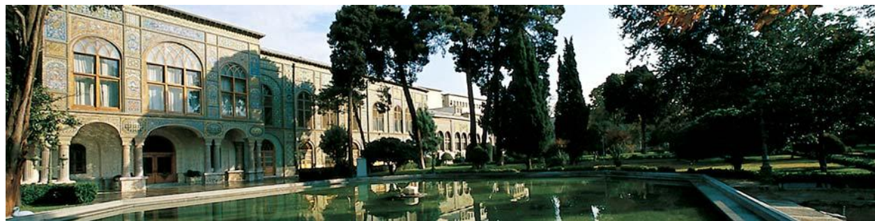
Figure 1: An overview of Golestan Garden

When Qajar dynasty was overthrown, due to the facilitated travels between Iran and other European countries, it became very common to build villas, parks and gardens in European style or a combination of Iranian-European style. It is clear that the reason for their interest in these styles lay in their familiarity with European garden making designs as well as the growing number of cars commuting between different cities. Most of these gardens and parks were established in 1971. These parks were common in the form of public parks, parks intended for children as well as boulevards across cities. Moreover, during Pahlavi era, most old parks and gardens were redesigned in the form of semi-european ones (figure 1).