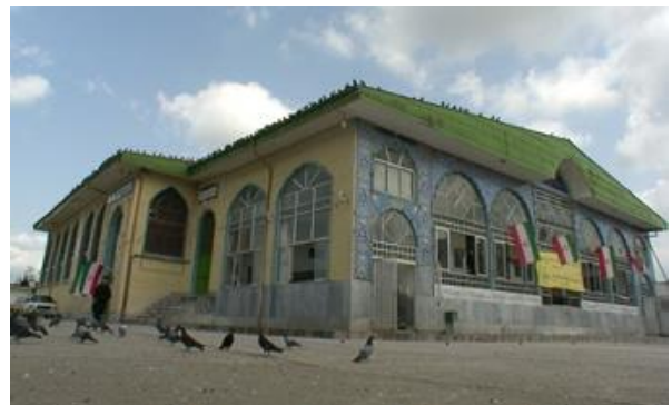
Figure 2: The Changes Done to Imam's Sister