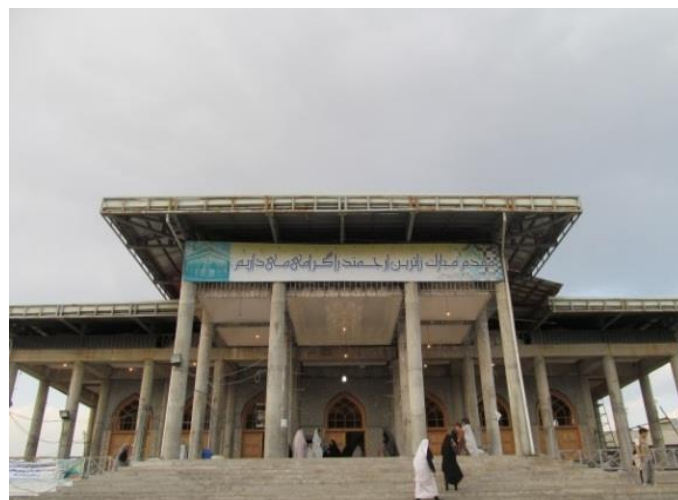
Figure 3: The Extension Added to Imam's Sister