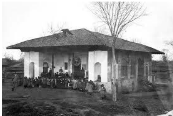
Figure 1: Old Picture of Imam's Sister